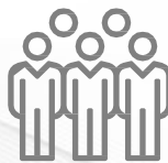
Human in the loop