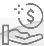
Loan eligibility and fee assessment