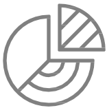
Automated data extraction